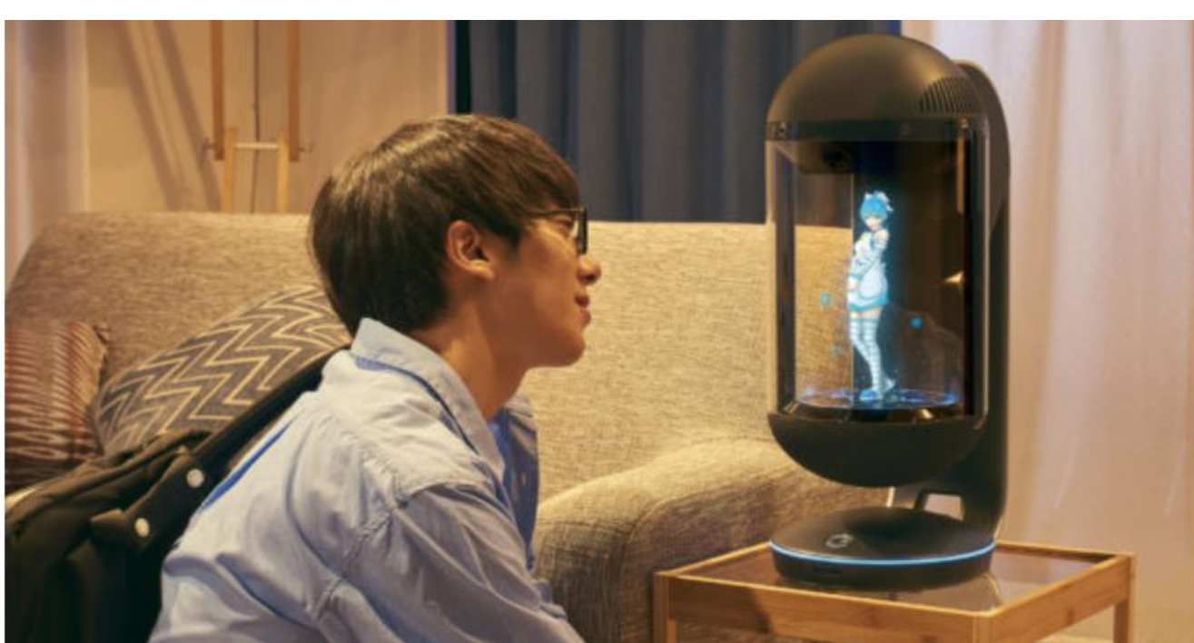
An interactive scene from 's promotional video.

Eg. Robot production, Emotional technologies, K-cars in Japan.